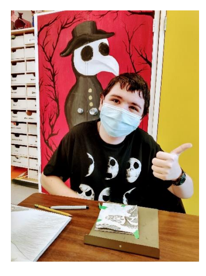
image development strategies and to learn this challenging technique. The prints turned out great!

students at Elkford Secondary School have been working on Lino-cut projects inspired by Aboriginal Ways of Knowing. Students had to design a picture representing First Nations' world views, carve the linoleum and print the image. We used both creative and critical thinking - for the