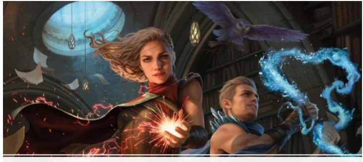
Magic: The Gathering Club Mondays @ lunch in rm. 116