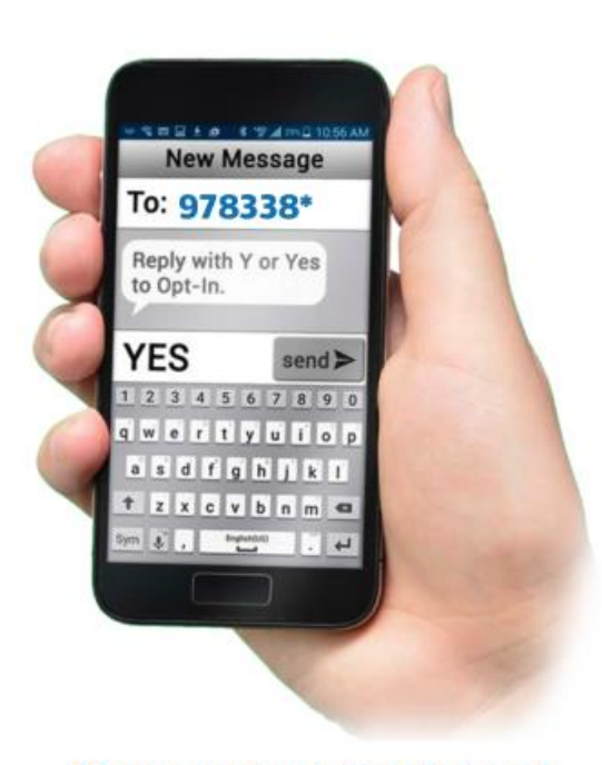
*if your number is Canada-based.

You will receive a text message requesting you to opt into your school or School District 5 text message alert service. This number was provided through your contact information in MyEducation BC.