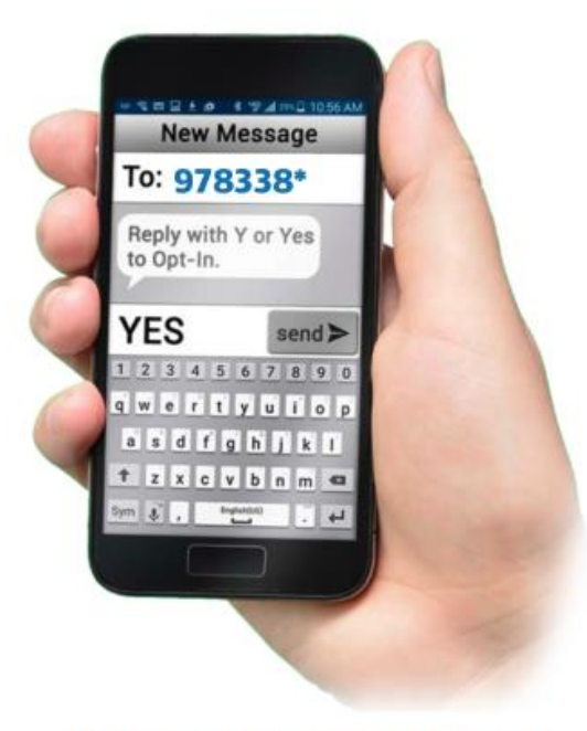
*if your number is Canada-based.