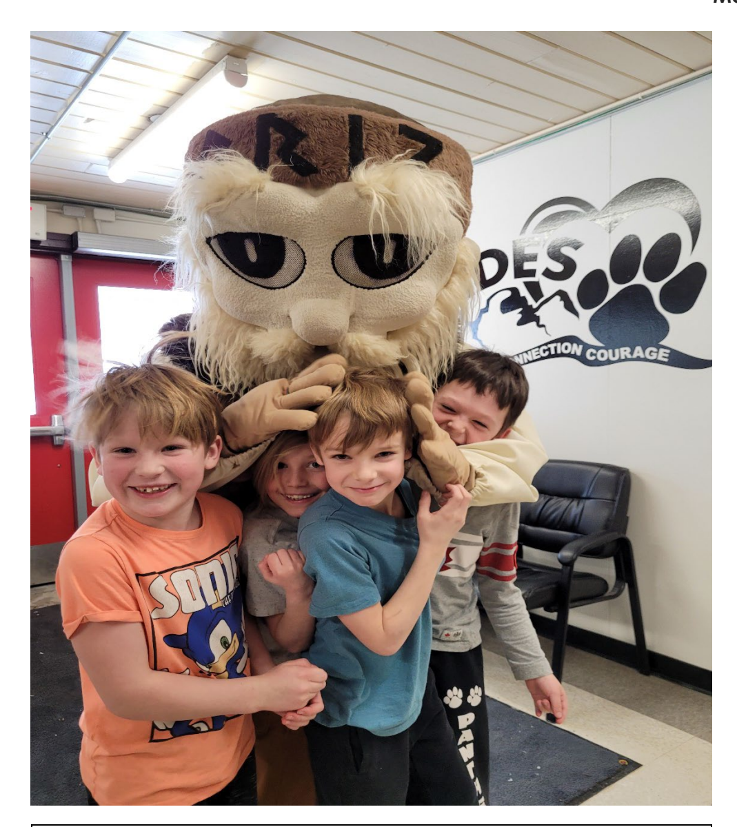
We love visits from the GRIZ!