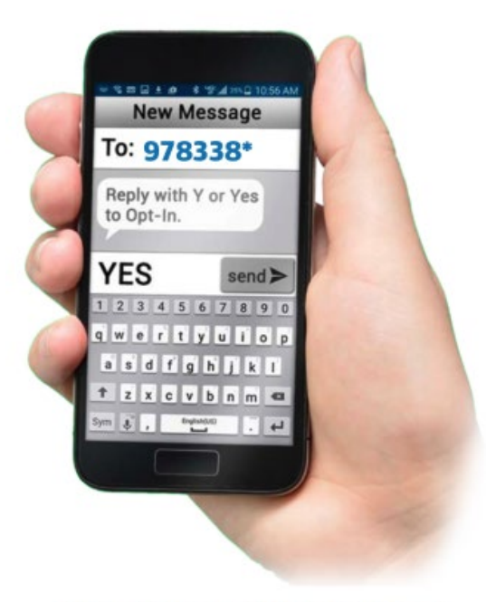
*if your number is Canada-based.

You will receive a text message requesting you to opt into your school or School District 5 text message alert service. This number was provided through your contact information in MyEducation BC.