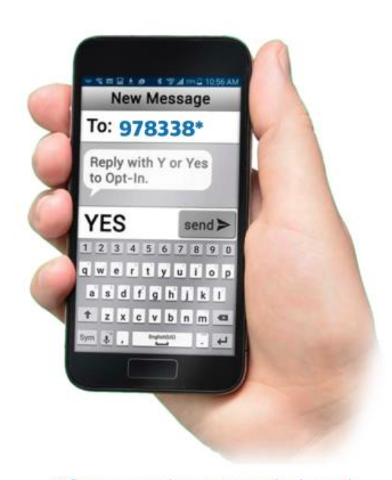
*if your number is Canada-based.

You will receive a text message requesting you to opt into your school or School District 5 text message alert service. This number was provided through your contact information in MyEducation BC.