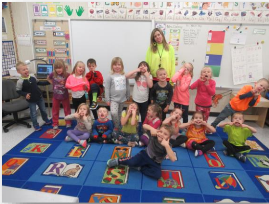
Neon Day in the Kindergarten Classroom!