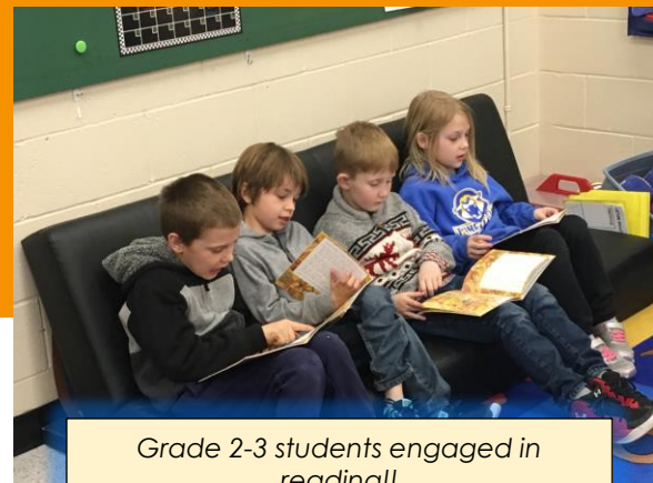
Grade 2-3 students engaged in reading!!

Pinewood is holding a raffle for 3 fantastic Christmas baskets. Tickets are $2 each or 3 for $5 and will be available the week of December 2, with the draw to be held at the Christmas concert on Wednesday December 18 at Key City Theatre. All proceeds will support the music program.