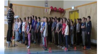
Remembrance Day Assembly on November 7