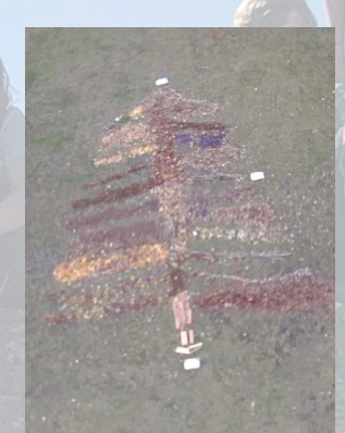
TAKE ME OUTSIDE AT ISABELLA DICKEN