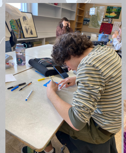
MBSS LEADERSHIP CLASS