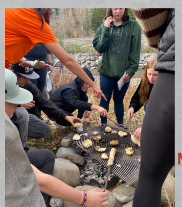
COOKING BANNOCK WITH METIS ELDERS AT SPARWOOD SECONDARY