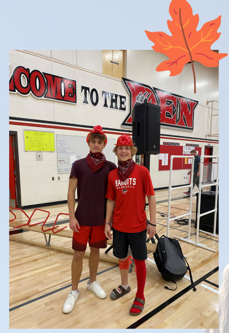
MBSS WILD DAYS