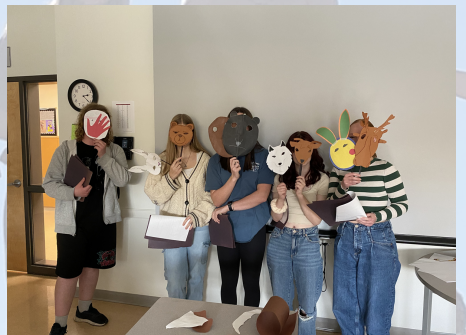
KTUNAXA LEGENDS READER'S THEATRE