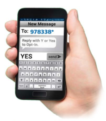
*if your number is Canada-based.

standard message and data rates may apply