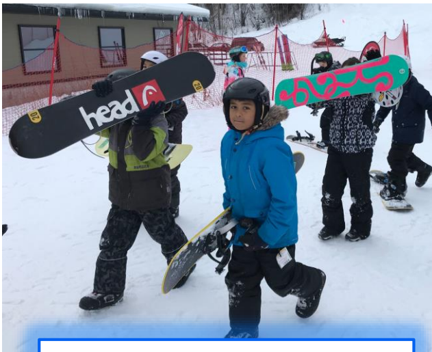
Grade 4, 5 and 6 students hit the slopes!