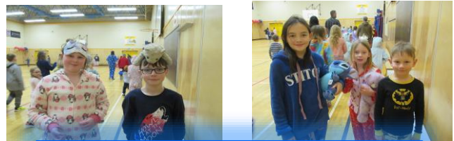
PJs rule at school!