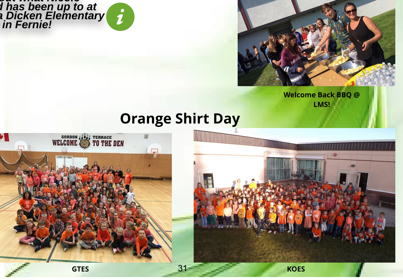
Purpose • Passion • Persistence