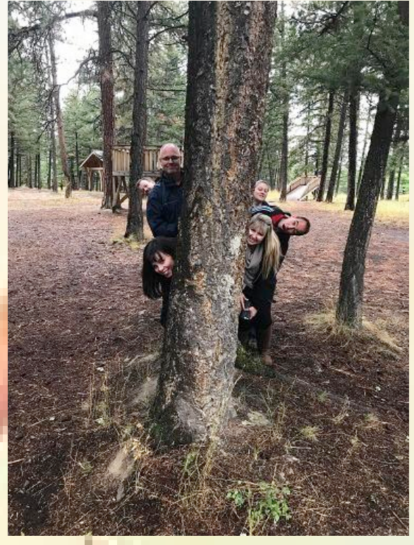
MBSS staff - Joseph Creek Project Field Trip

Aboriginal Understandings and the Renewed Curriculum Explore fossil beds and create department appropriate lessons Field trip to get immersed into the Joseph Creek Project with break-out sessions linking the project to science, business, technology and history (with indigenous content).