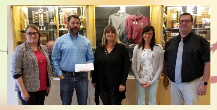
Thanks so much to Komatsu Mining and their employees, for fundraising and supporting the SSS Breakfast Program.