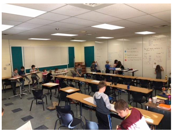
Students working on math in new flexible working classroom at SES!