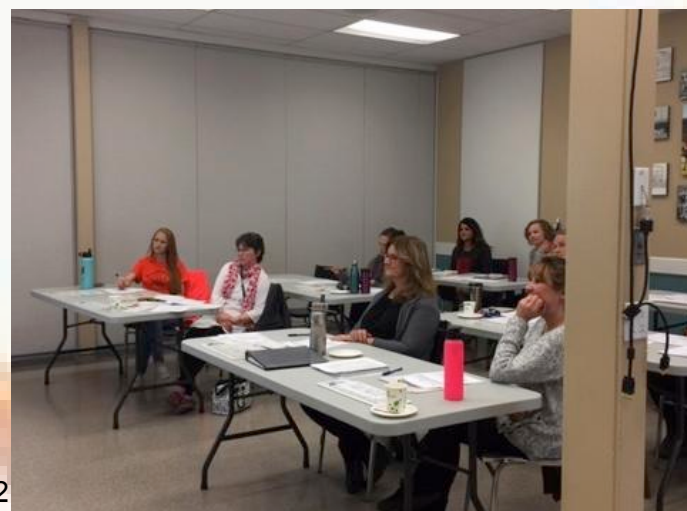
Purpose · Passion · Persistence