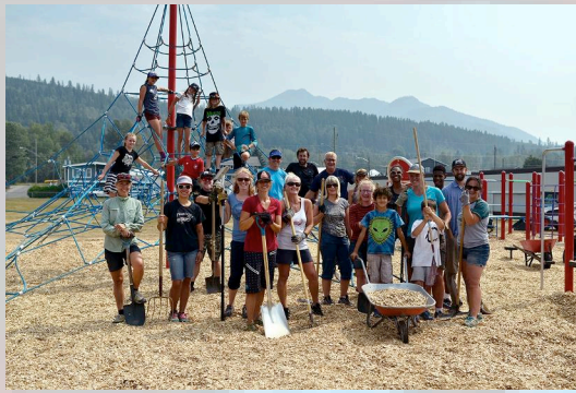
Intermediate Playground volunteer wood chip crew at Isabella Dicken Elementary School!!