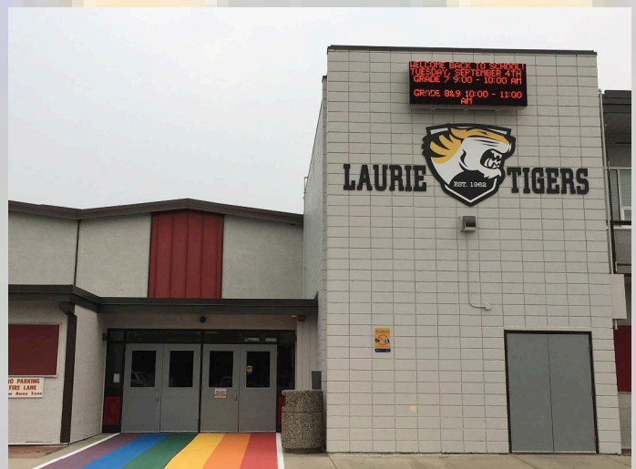
Rainbow Crosswalk at Laurie Middle School a welcome addition over the summer!