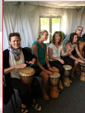
PVPs drumming with the District Resource Centre's new Djembe Drums.