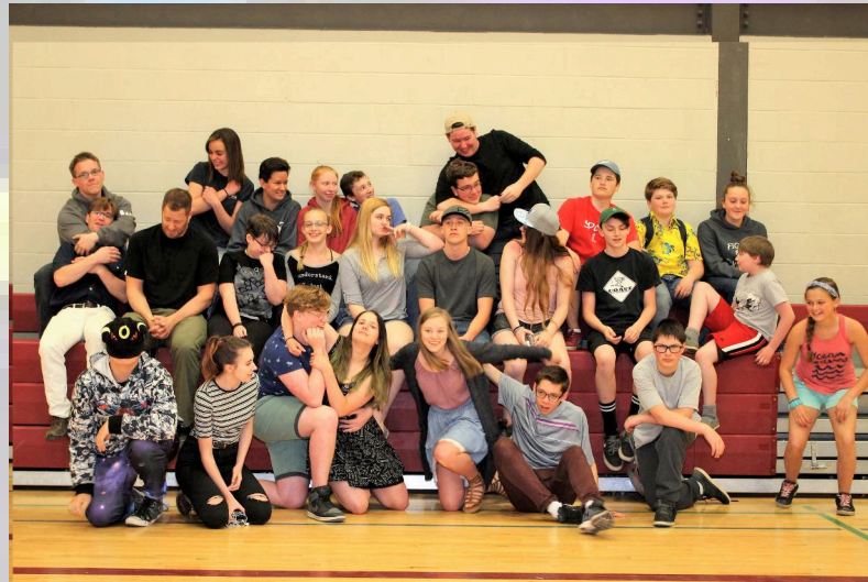
Cast of Sparwood Secondary School — The Princess Bride.