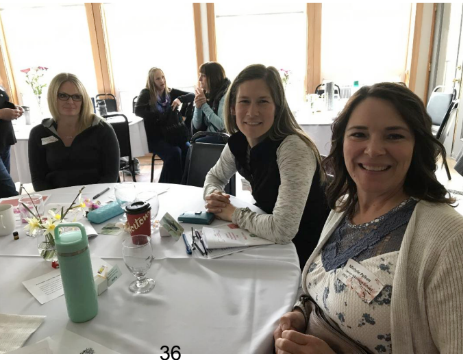
Purpose · Passion · Persistence

Forty clerical staff from all schools and the Board Office took part in a Clerical Pro-D Day in Fernie on May 3, 2019. Lots of learning, sharing and networking made for a great professional development day for all!