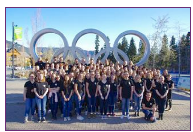
International Music Festival-Whistler

https://www.cotr.bc.ca/press/fullhdLine.asp?ID=921