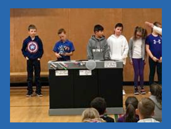
Gordon Terrace Elementary celebrated Earth week with a Virtue Assembly on Respect and Helpfulness. They also launched their new recycling program with a new recycling banner and new recycling bins.