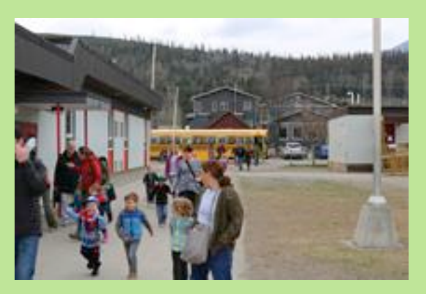
IDES (76 3-4 year olds and 70 adults attended)