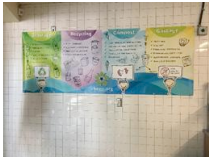
Fernie Secondary proudly displays their recycling banner and re-introduced the composting and recycling program.

Other students at Isabella Dicken also participated in an Art Start cross curricular project using native plants/berries to create art. They then wrote about the historic uses of the plants as well as prose/stories/ poems.