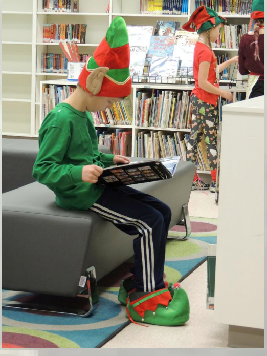
Elf in the library at Isabella Dicken Elementary School (not on the shelf ... but near....)