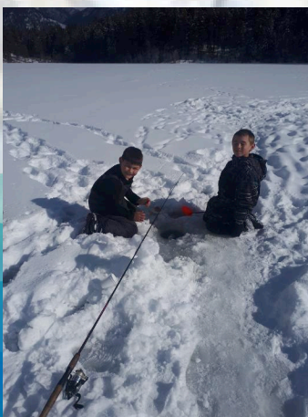
Ice fishing with Aboriginal Education boys' group at SES