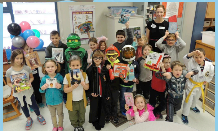
As part of our school's growth plan to increase the love of literacy, our school had a "dress up as a book character day" at TMRES