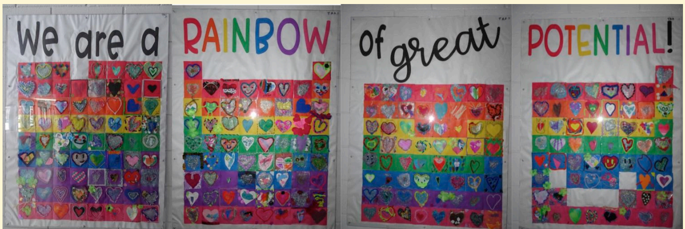
HES Acceptance Project