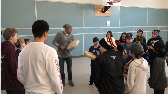
Youth Cultural Day at FSS