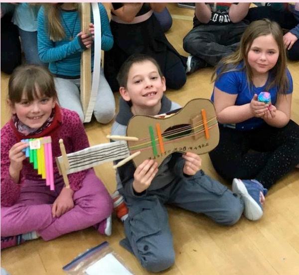
Spring Music Assembly at GTES

Our task is to assist the Ministry of Education with determining the best approach to implementing Recommendation 11 of the Report of the Funding Model related to Adult and Continuing Education. The working groups are expected to meet between three to five times between now and the fall to complete a list of recommendations outlining how to best educate members of the organizations on the proposed changes and complete the reporting template that lists the specific implications of the implementation scenario, identifies corresponding strategies on how they can be addressed and considers how best to monitor the implementation process to ensure that it is successful.