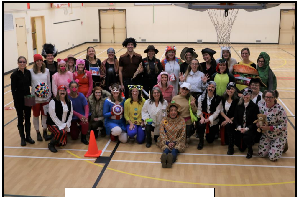
Staff Halloween Photo 2019!