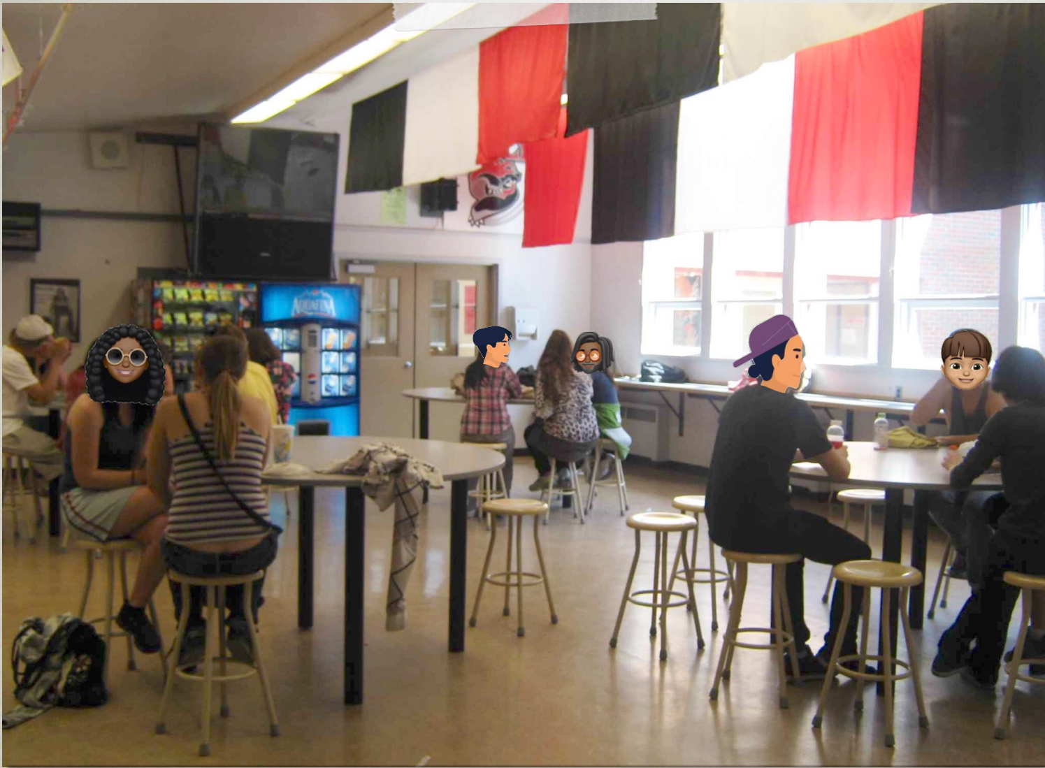
The Student lunch room