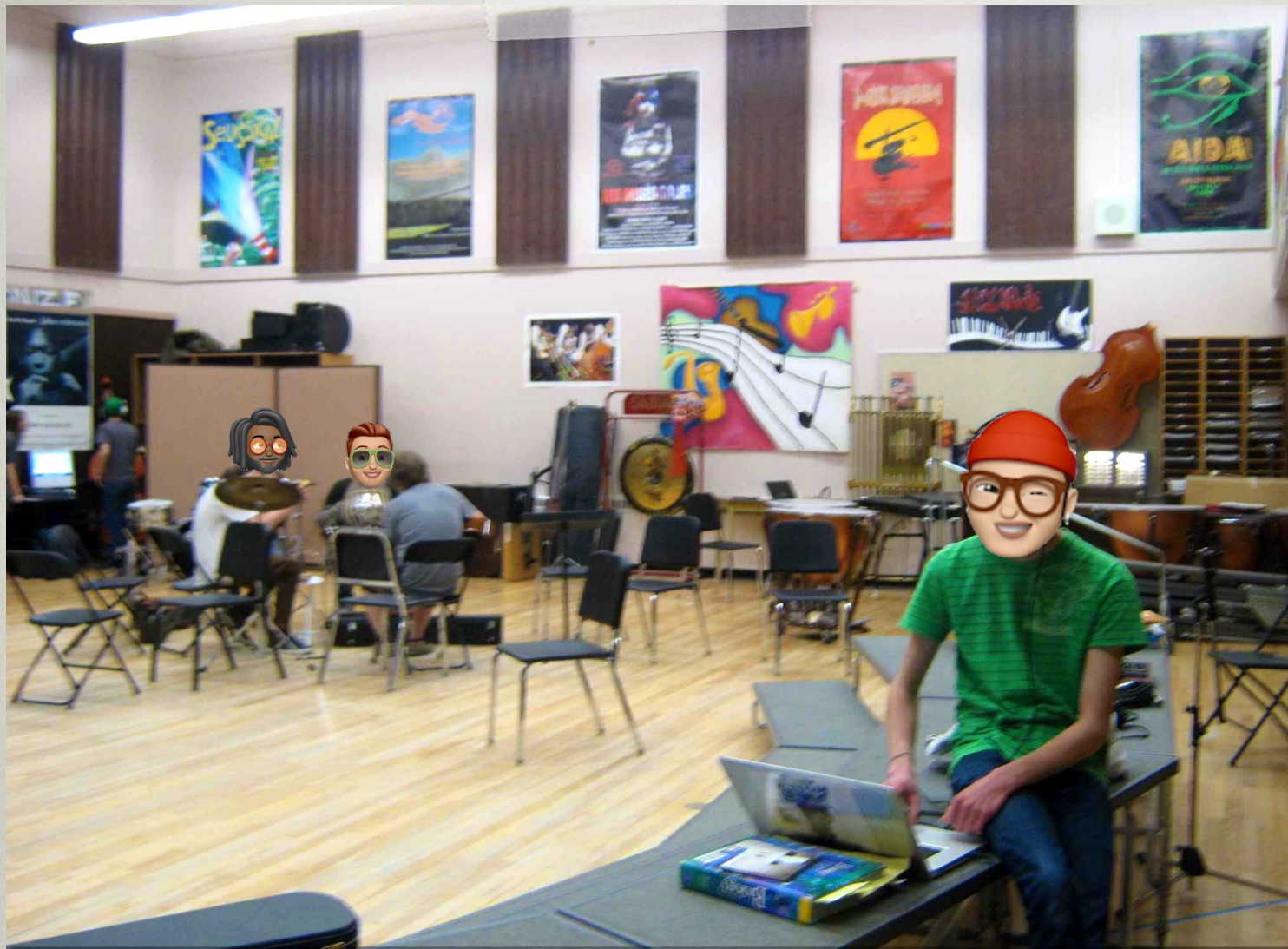
The music room