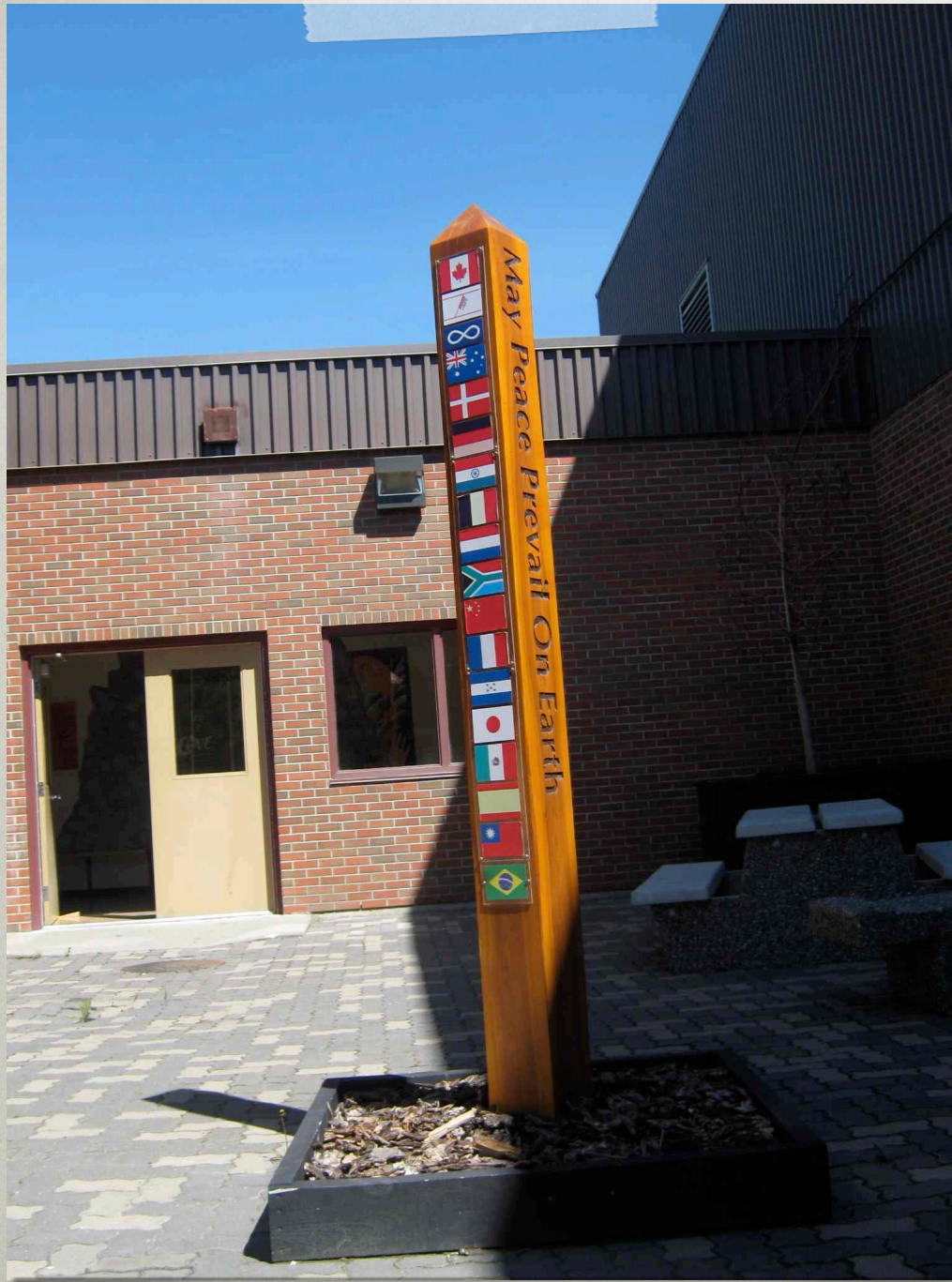
The patio and its Peace Pole