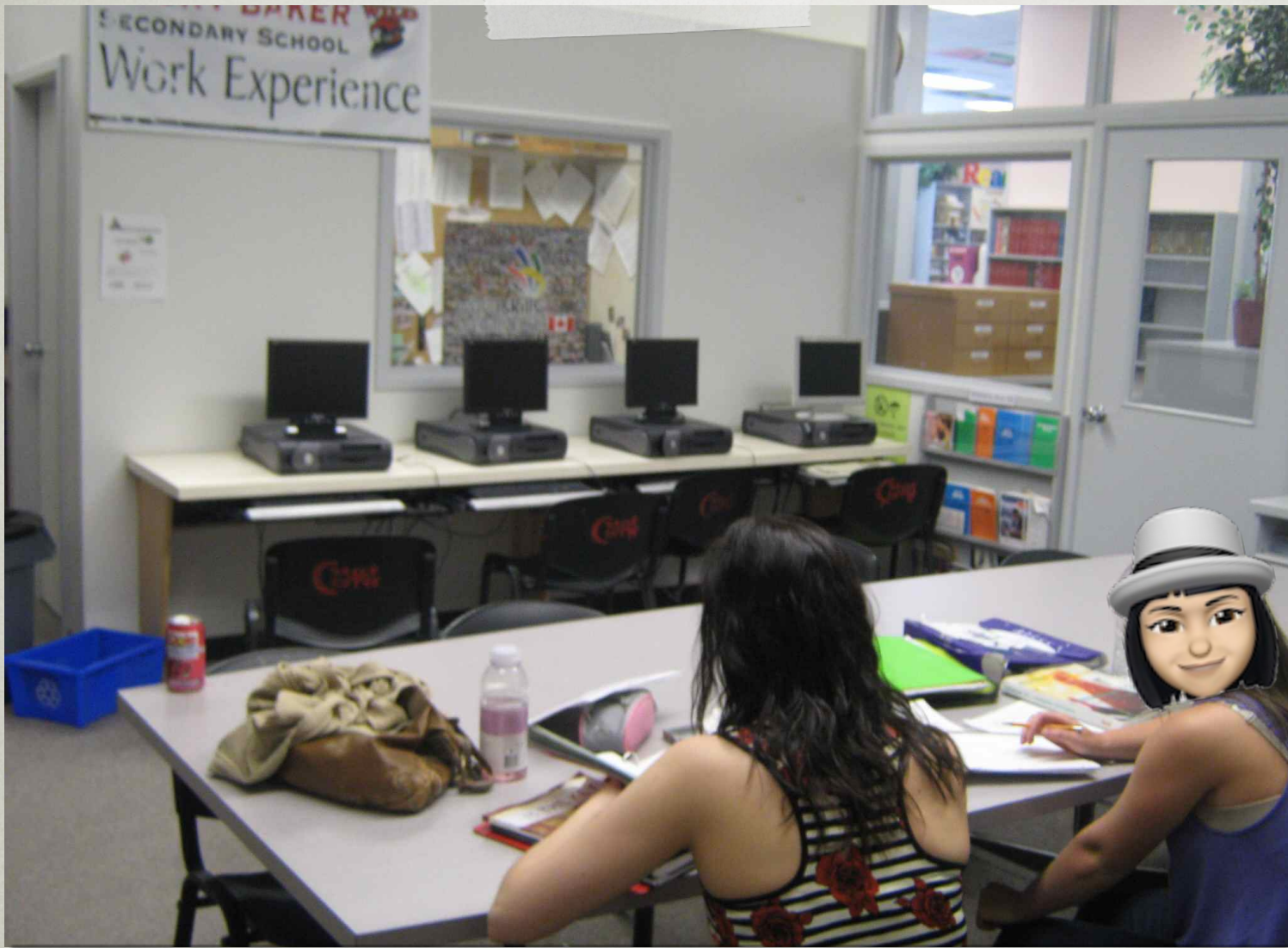
The Career centre