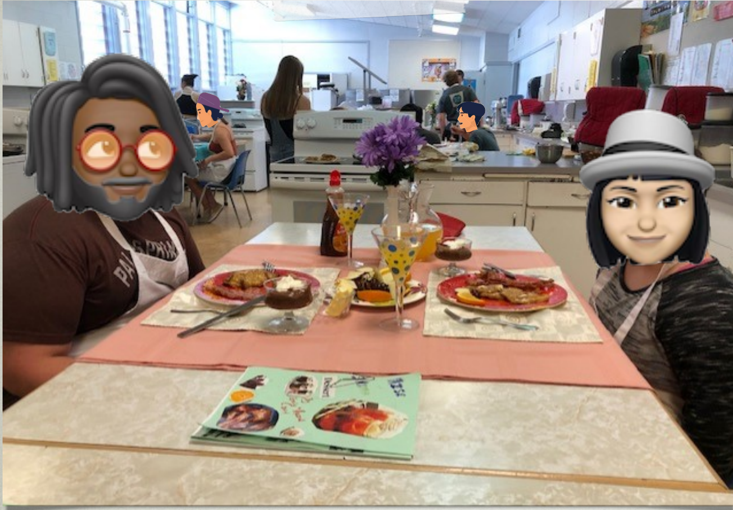
The Foods room