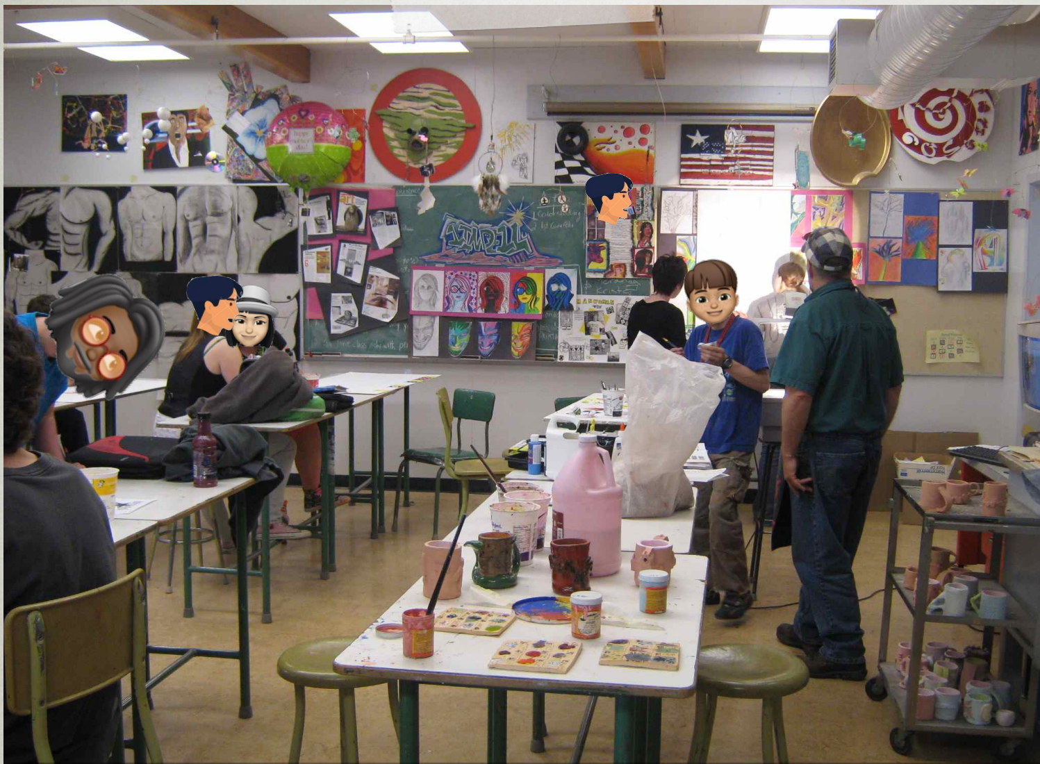
The Art room