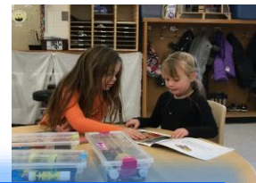
Sharing stories in Kindergarten!