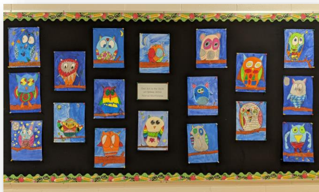
Grade 3-4 class presents Owl Art in the Style of Ojibwa artist Norval Morrisseau