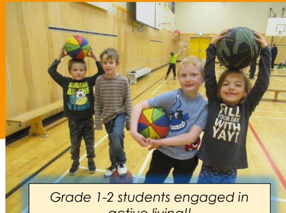
Grade 1-2 students engaged in active living!!