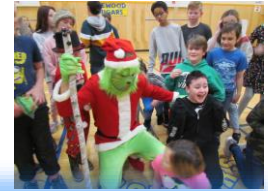
The Grinch makes a special appearance at Pinewood!