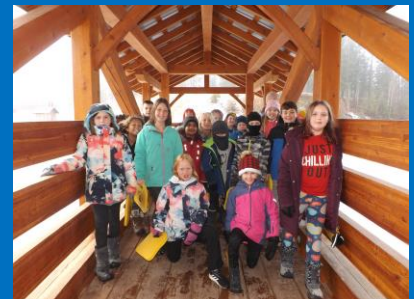
Outdoor Classroom at Idlewild Park