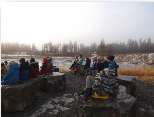
A serene spot in the Idlewild Park outdoor classroom

Each month we will feature writing from a Pinewood student. Please enjoy this illustrated submission from Colton in the Grade 2-3 class.