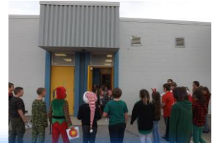
Grade 5 and 6 students share the spirit of the season caroling with their schoolmates