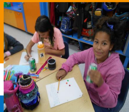
Skittles + Soda = Science!