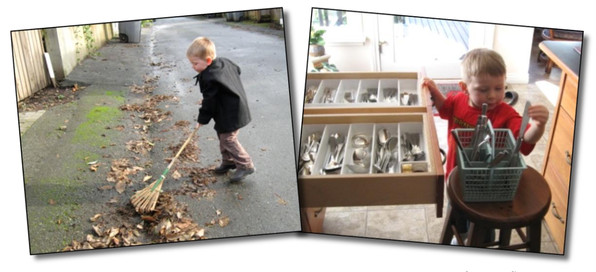
I am learning to start and complete tasks. I am proud of myself!

Help with meal planning, grocery shopping, making meals and snacks, setting the table, baking, making their bed, cleaning their room, putting toys away, organizing belongings, dressing themselves, choosing what to wear, separating clothes for the wash, folding clothes from the dryer, simple yard work, cleaning out the car, taking out the garbage, recycling and feeding pets.